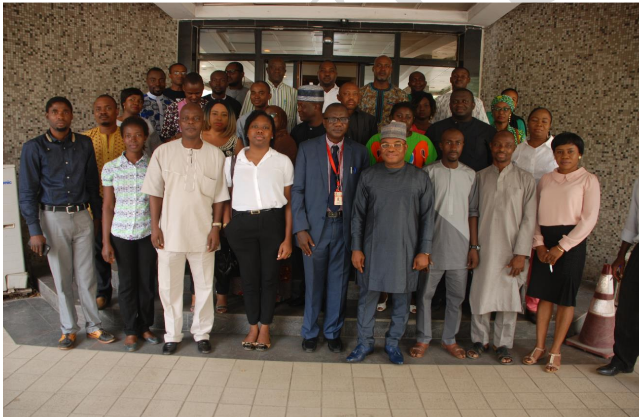
Group picture of participants